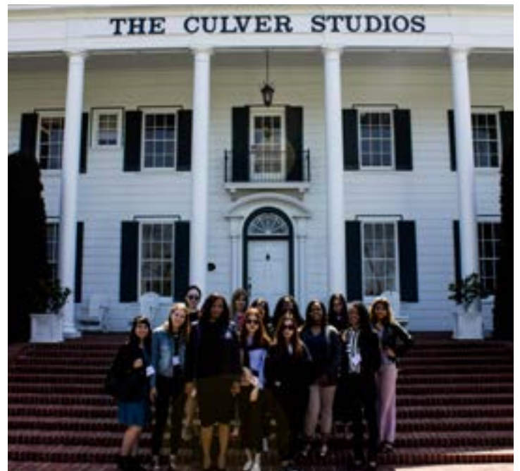
Students at Amazon Studios.