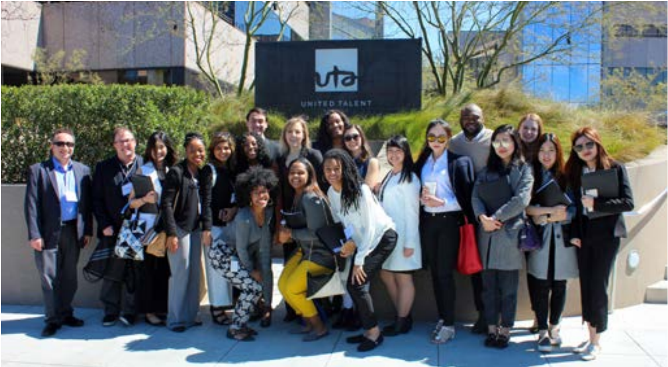
Students outside of United Talent Agency.