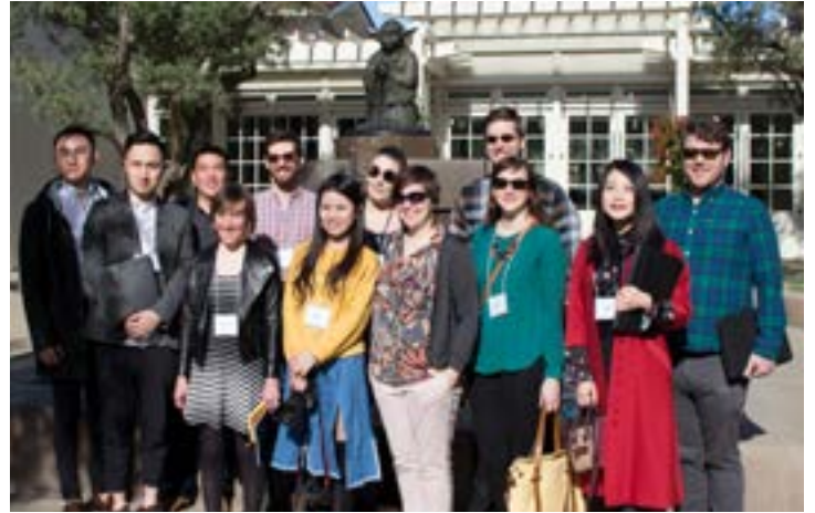
Students at Lucasfilm.