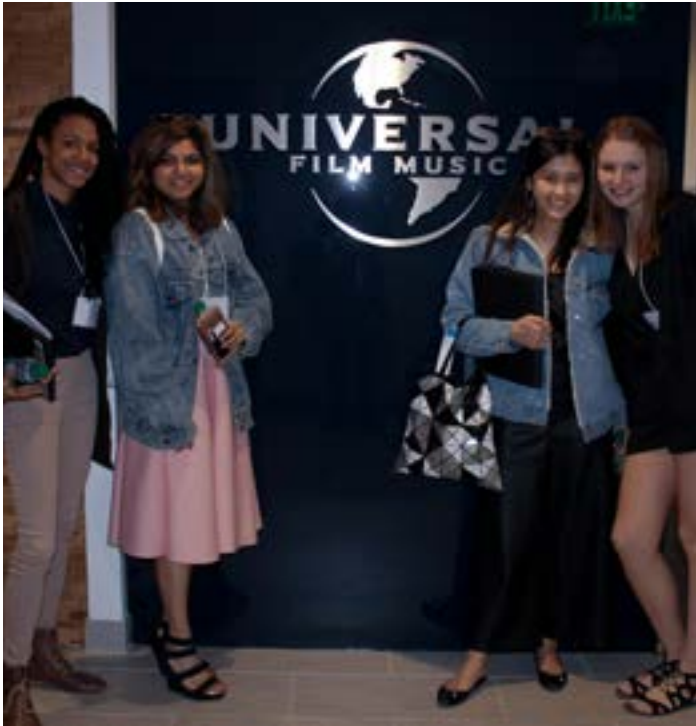
Students at Universal Film Music and Publishing.