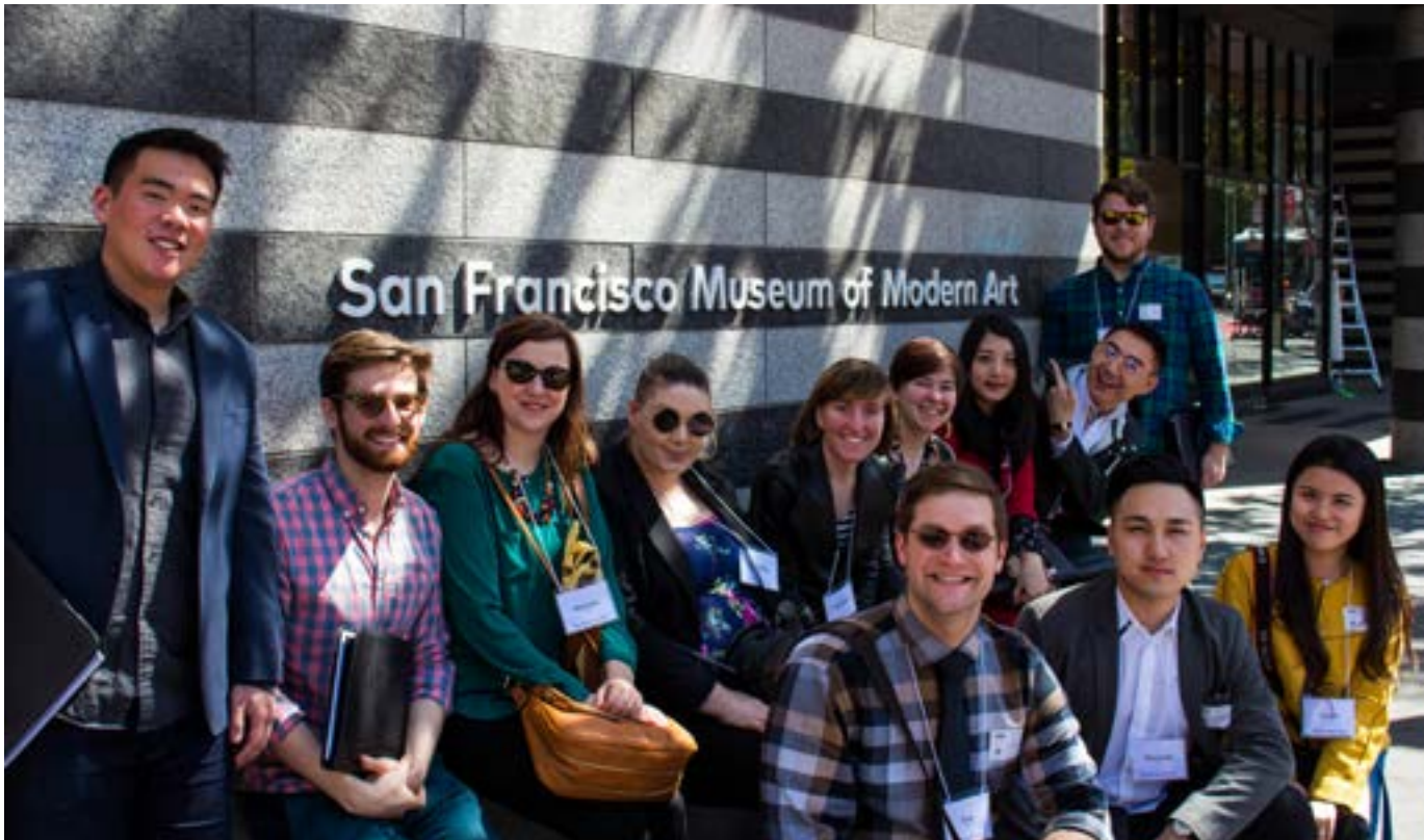
Students at the San Francisco Museum of Modern Art.