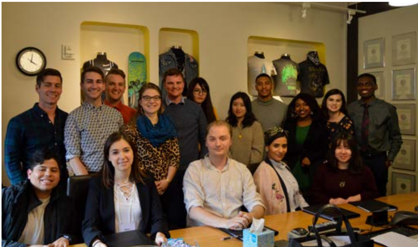
Students at The Araca Group.