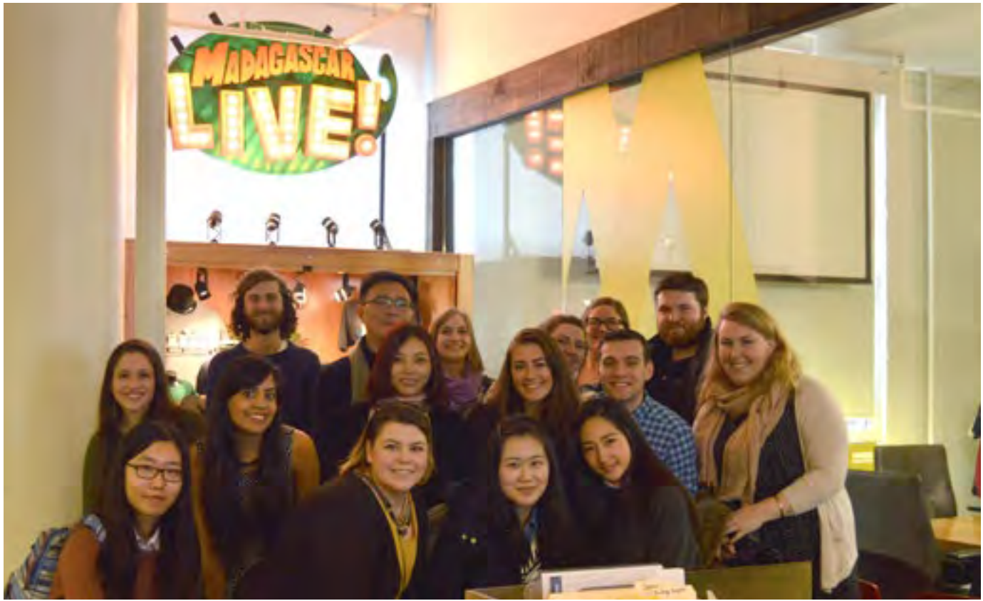
Students at The Araca Group office in Hell's Kitchen.