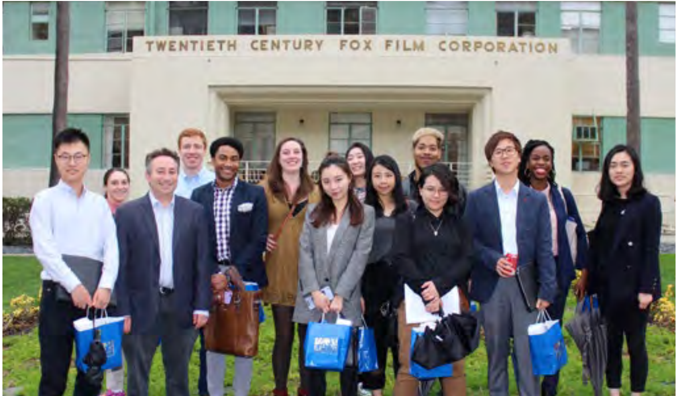
Students at Fox Searchlight.